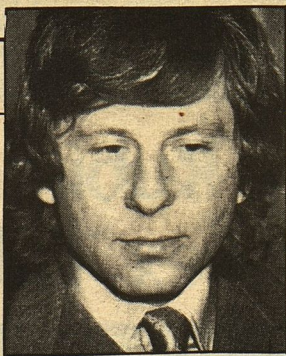
Roman Polanski: A contract out for Charlie Manson