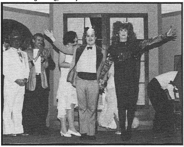
Birth of an Empire: The first Emperor & Empress of Chico.